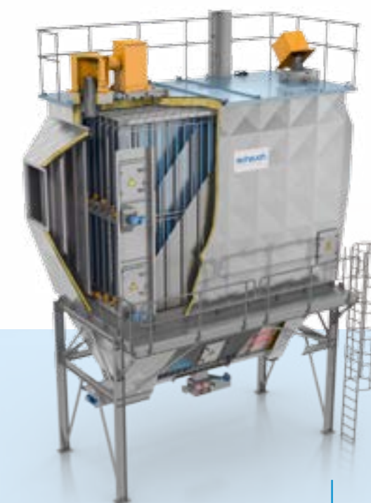
SCHEUCH ELECTROSTATIC PRECIPITATORS- TECHNOLOGY